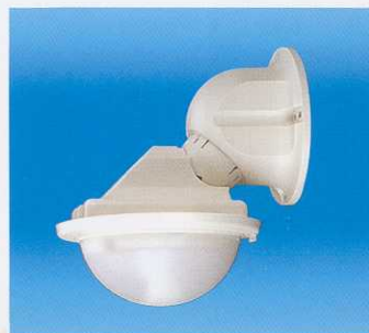
Wall / Ceiling mount (Optional attachment : BCW-401)

COMPACT APPEARANCE, OUTSTANDING PERFORMANCE AND LOW PRICED